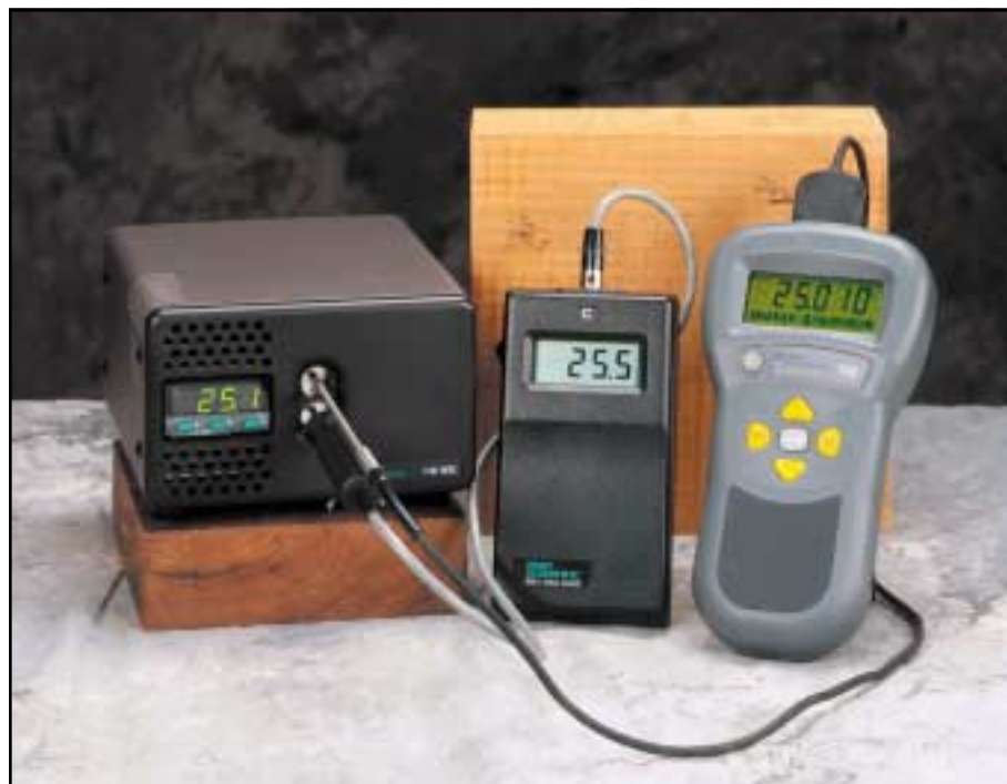
Model 1521 and 1522 Handheld Thermometers make excellent reference thermometers for field calibrations.

"Min" and "Max" functions store the lowest and highest readings since the last reset. The "Hold" function freezes and stores the current reading (up to six may be stored) for later recall. And the "Delta" function computes the difference between the current reading and a