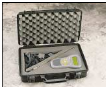
The Model 9318 Hard Carrying Case protects your Handheld Thermometer, a probe, and all your accessories.

See our calibration and data acquisition software packages on page 78.