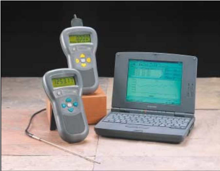
LogWare software can be used to graphically and statistically analyze data logged to the Model 1522 LLL. LogWare can also turn either Handheld Thermometer into a real-time datalogger.

reference value, which may be recorded at any time.