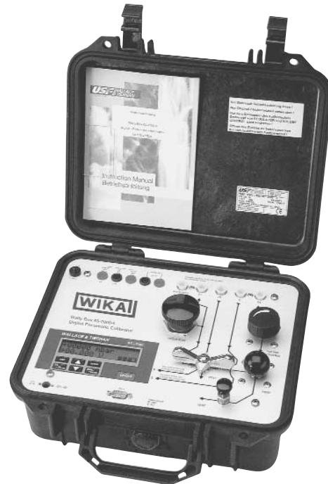
Wally Box 65-2000 II

The accuracy of the pressure measuring system is 0.02 % of reading (incl. linearity-, hysteresis- and temperature error).