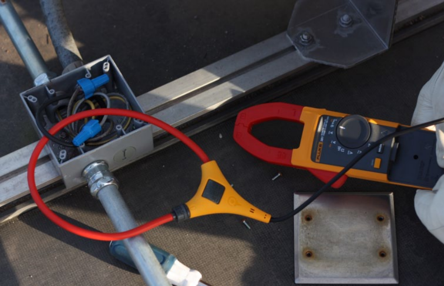
To measure the current output of this photovoltaic cell, a technician wraps the 381 iFlex™ flexible current probe around the conductor.

When you get up on the roof, visually check the entire system for any obvious damage. Also, keep in mind that someone may have disconnected the wiring accidentally while servicing another device on the roof. Once the module or array that is not producing power is found, check all wiring, switches, fuses, and circuit breakers. Replace blown fuses and reset the breakers and switches. Keep in mind that since the PV system is on the roof that a lighting strike or power surge may have affected it. With the large amount of wiring present, check for broken wires and loose or dirty connections. Replace and clean as needed. Especially be on the lookout for wire nuts that are connecting modules together. They may have worked loose and caused lack of contact.