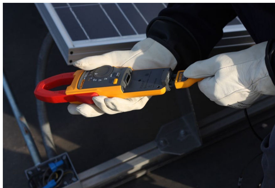
A technician attaches the iFlex™ flexible current probe of a 381 Clamp Meter as he prepares to troubleshoot a photovoltaic system.

A good place to start is to check the output of the entire system at the metering system or at the inverter. Prior to getting on the roof, check and record the inverter's input voltage and current level from the array. If the entire PV system is down and not producing power it may be an inverter problem. If the PV system is operating at a reduced power output the problem may be one of the arrays or modules. You will have to trace out the individual branch wiring backward from the concentrator. Again, the iFlex™ makes this an easier job than it would be otherwise.