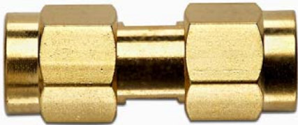
Model 72964 SMA PLUG (M) / PLUG (M)

35 Vantage Point Drive // Rochester, NY 14624 // Call 1.800.800.5001