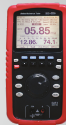
SBS-6500 Battery Analyzer

For more information on the hydrometer, see the SBS-2003 data sheet.