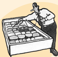
● Frozen food products quality control