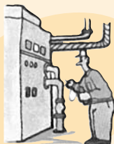
● Temperature management in production processes