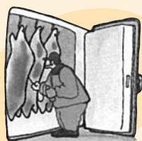
● Temperature management in a refrigerated warehouse