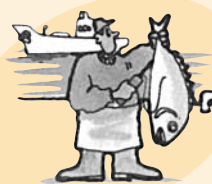
● Perishable foods quality control