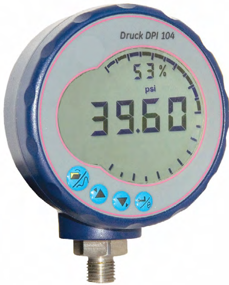
Safe Area pressure gauge