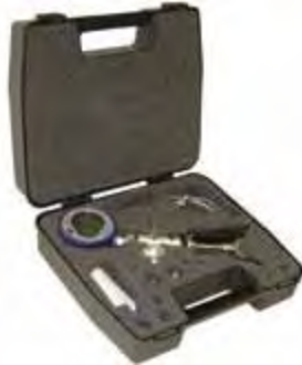
Pneumatic test kit