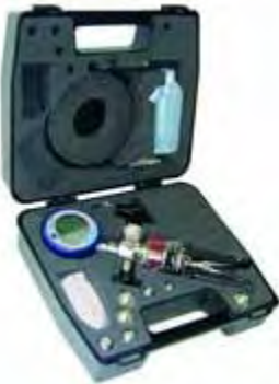
Hydraulic test kit