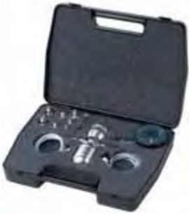
Low pressure pneumatic test kit

Includes: DPI 104; ranges to 700 bar (10,000 psi), PV 411A combined pneumatic and hydraulic test pump, hydraulic reservoir, hose, adapters, PRV, seal kit and case.