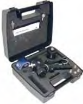
Pneumatic and hydraulic test kit