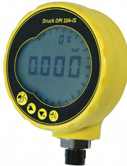
Hazardous Area pressure gauge