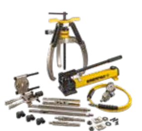
Hydraulic Lock-Grip Master Puller Sets, LGHMS-Series