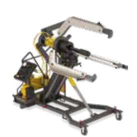
100 tons Hydraulic Lock-Grip Pullers, LGH-Series