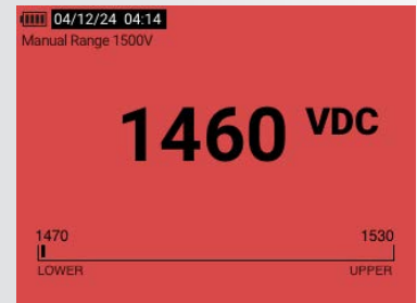
Limit gauge – outside of range