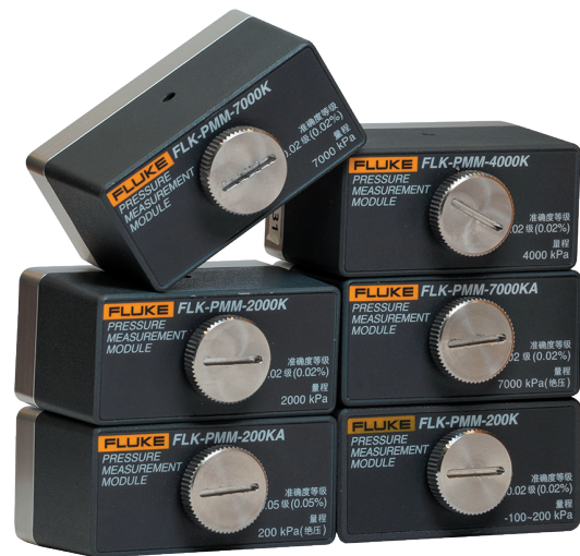
Figure 1. Rechargeable lithium battery with capacity indication.

HART communication enables mA output trim, trimmed to applied values, and pressure zero trimming of HART pressure transmitters. You can easily change a transmitter tag, measurement units and ranges. Other supported HART commands include setting fixed mA outputs for troubleshooting, reading device configuration parameters and reading device diagnostics.