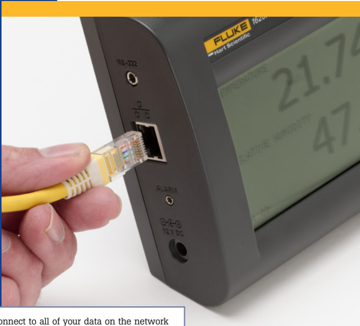
Connect to all of your data on the network