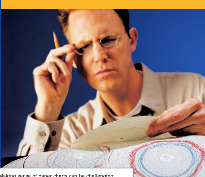
Making sense of paper charts can be challenging.