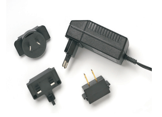
Worldwide compatible AC adapter/charger (SNT-121A)