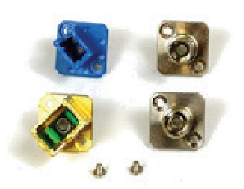
Optical adapters (BN 2155) for laser source output